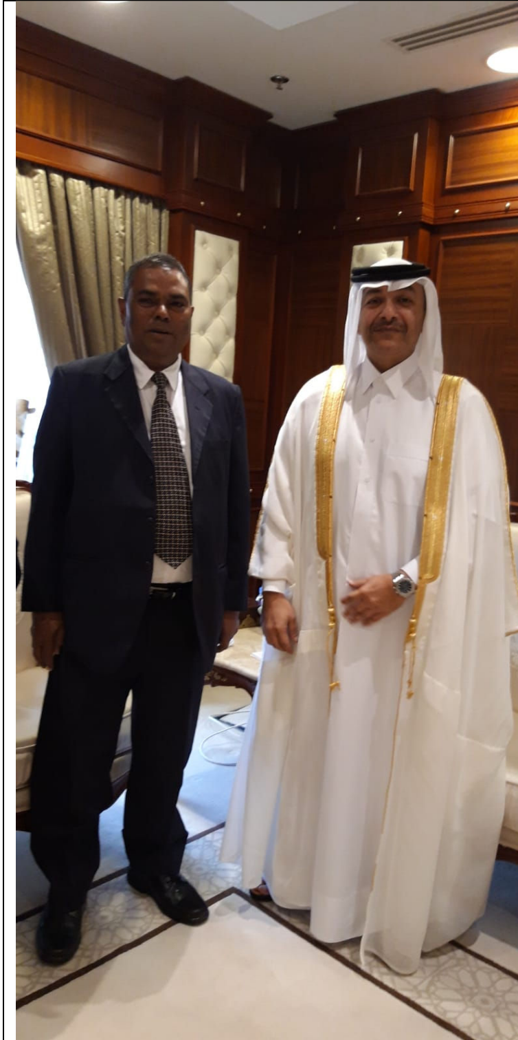
Hon. Mr. Upendra Yadav, Deputy Prime Minister and Minister for Health and Population meeting with HE Minister of Administrative Development, Labour and Social Affairs of the State of Qatar