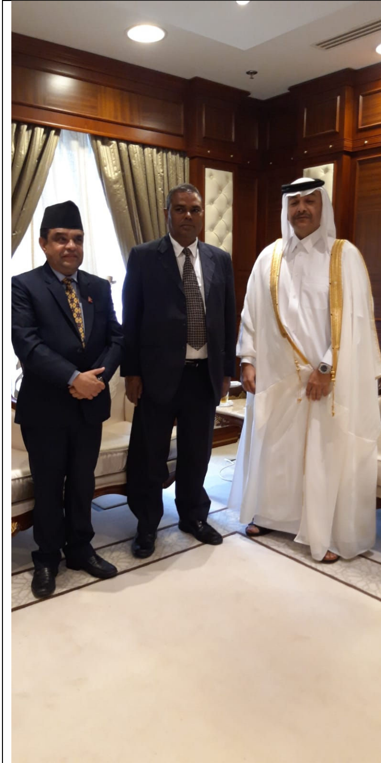
Hon. Mr. Upendra Yadav, Deputy Prime Minister and Minister for Health and Population meeting with HE Minister of Administrative Development, Labour and Social Affairs of the State of Qatar