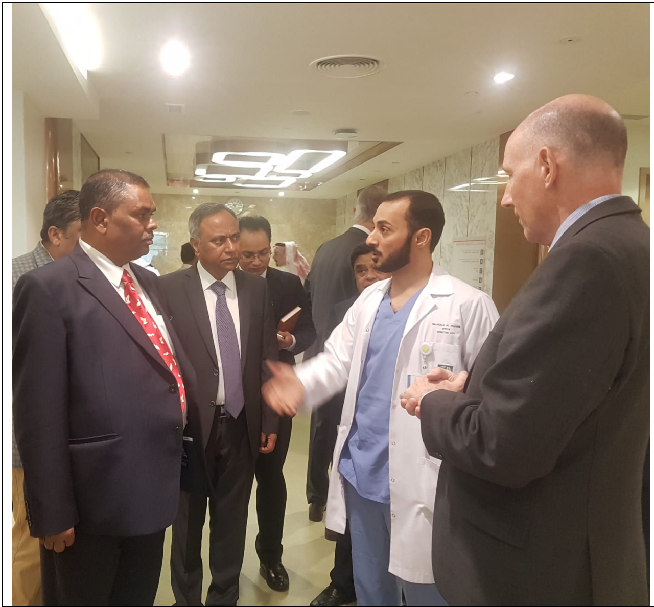
Hon. Mr. Upendra Yadav, Deputy Prime Minister and Minister for Health and Population briefed at Hamad Medical Corporation